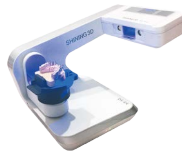
Black & White Texture